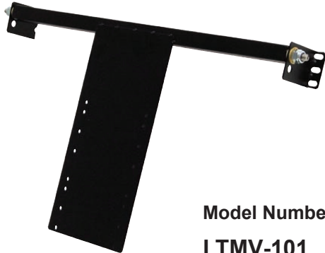
Model Number: LTMV-101

The LAN TEK LTMV-101 monitor mount allows easy installation of VESA 100mm mounting hole pattern monitors into 19" EIA equipment racks. The EIA equipment racks can be two post or four post and the monitors can be of any size. The LTMV-101 is manufactured of heavy gauge powder coated welded steel and features easily adjustable friction nuts on each side. The adjustment allows for setting the monitor viewing angle and also allows the monitor to be tilted out of the way to access any equipment which may be mounted behind the monitor.