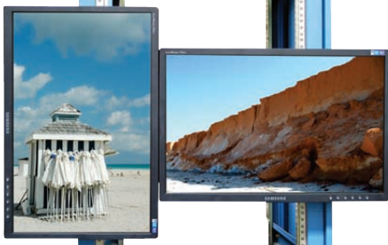
Dual 22" Monitors