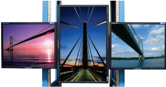
Dual 17" and Single 22" Monitors