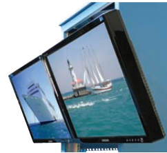
Dual 24" Monitors tilted to provide better viewing.