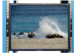
Single 20" Monitor