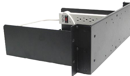
LTVF-03 with LTVS-02