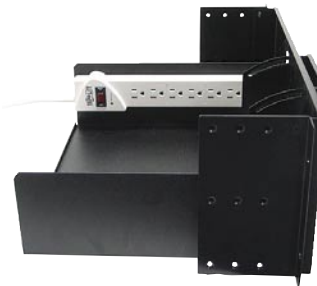
LTVA-04 with LTVS-02